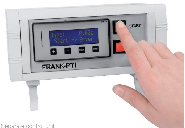
Separate control unit