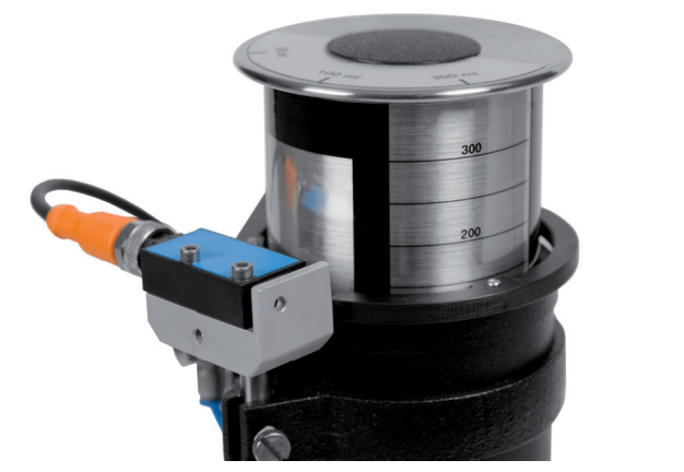
Robust cylinder with sensor and pneumatic lifting