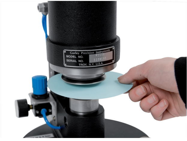
Sample is pneumatically clamped when the start button is pressed